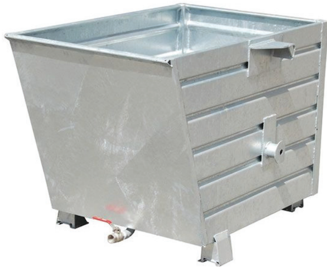
High strength construction with 6 skip volumes available