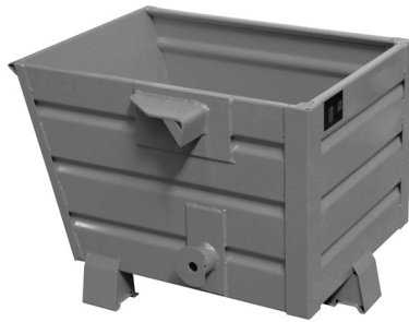
6 finishes available including Hot Dipped Galvanised